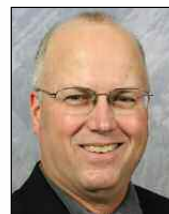
Bart Emery Coors Events Center