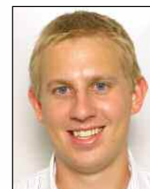
Justin Urman Promotions